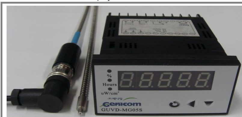
Fig. 1 UV Radiometer 5.0 (Size of Display : 97 × 50 × 112mm)